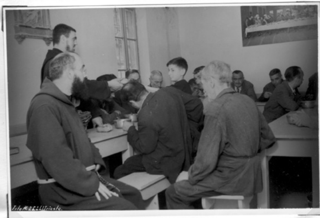
The new refectory.