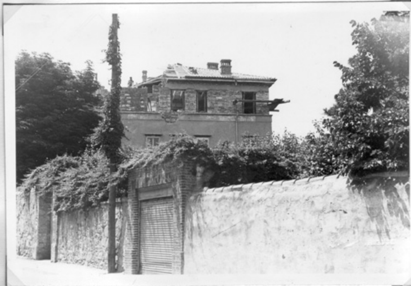
The new house bought, in course of transformation