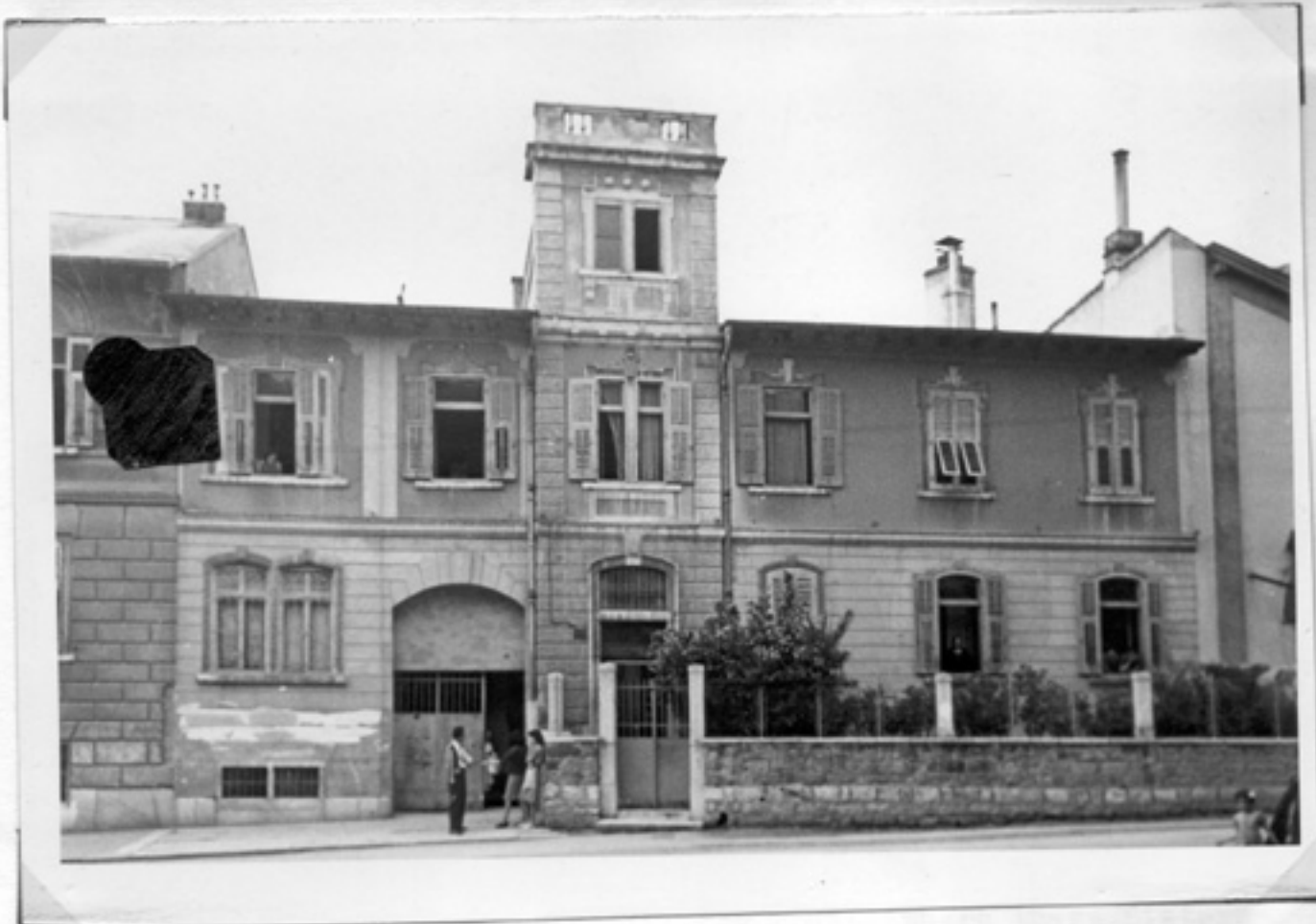
The new house bought.

Contribution towards the purchase of the house, the necessary repairs and the respective equipment, also purchase of some pieces of furniture, etc.