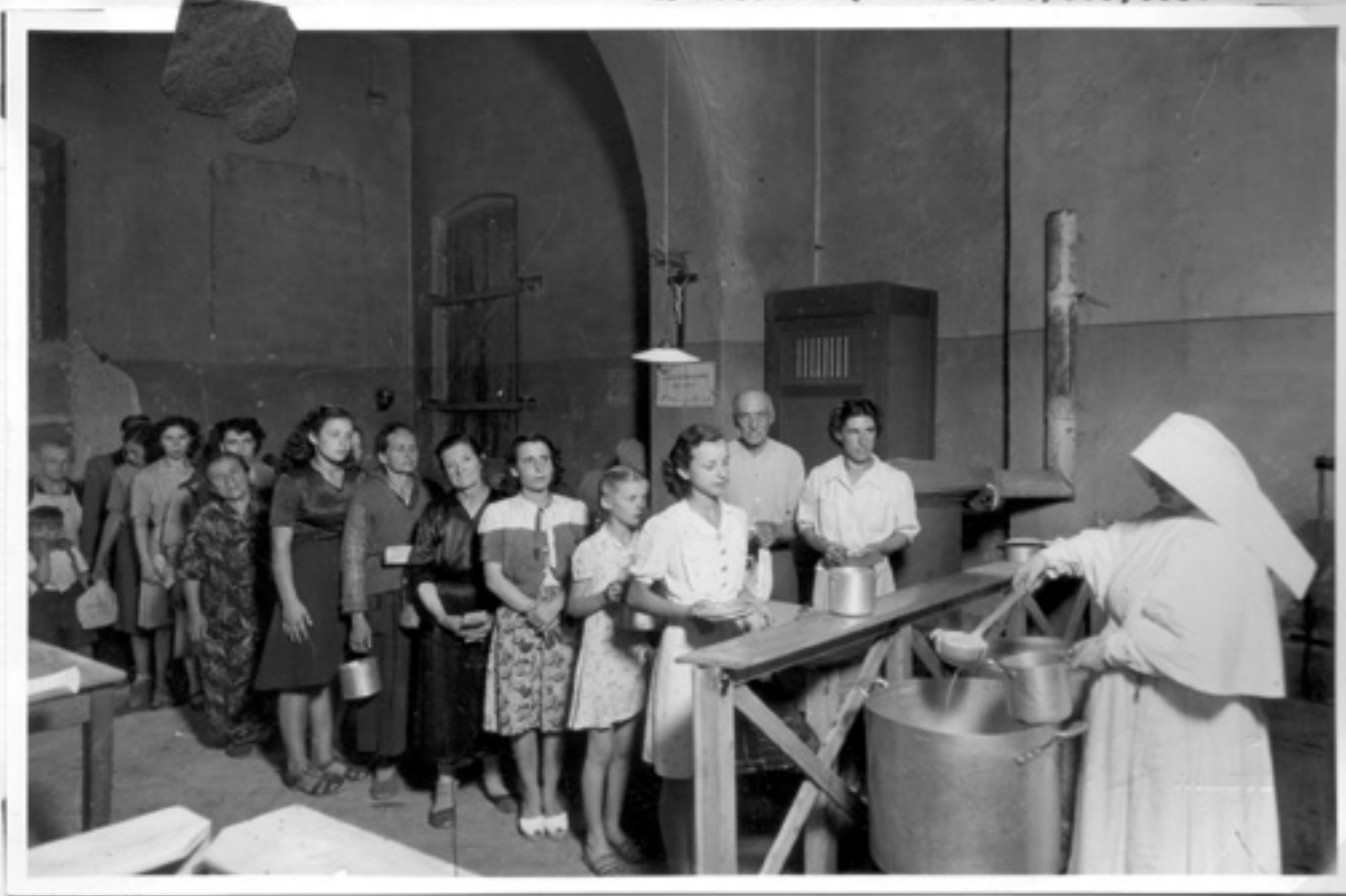
Kitchen: Campo San Giacomo