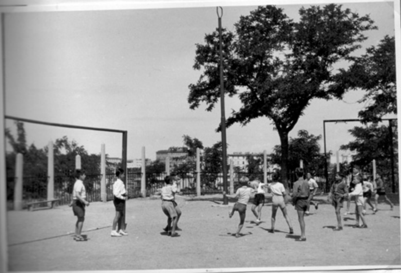
Playground at the Salesian Fathers'.

Purchase of equipment of different kinds, machinery and implements for the handicraft school, moving picture apparatus, playing sets for open-air games, musical instruments etc., as well as food.