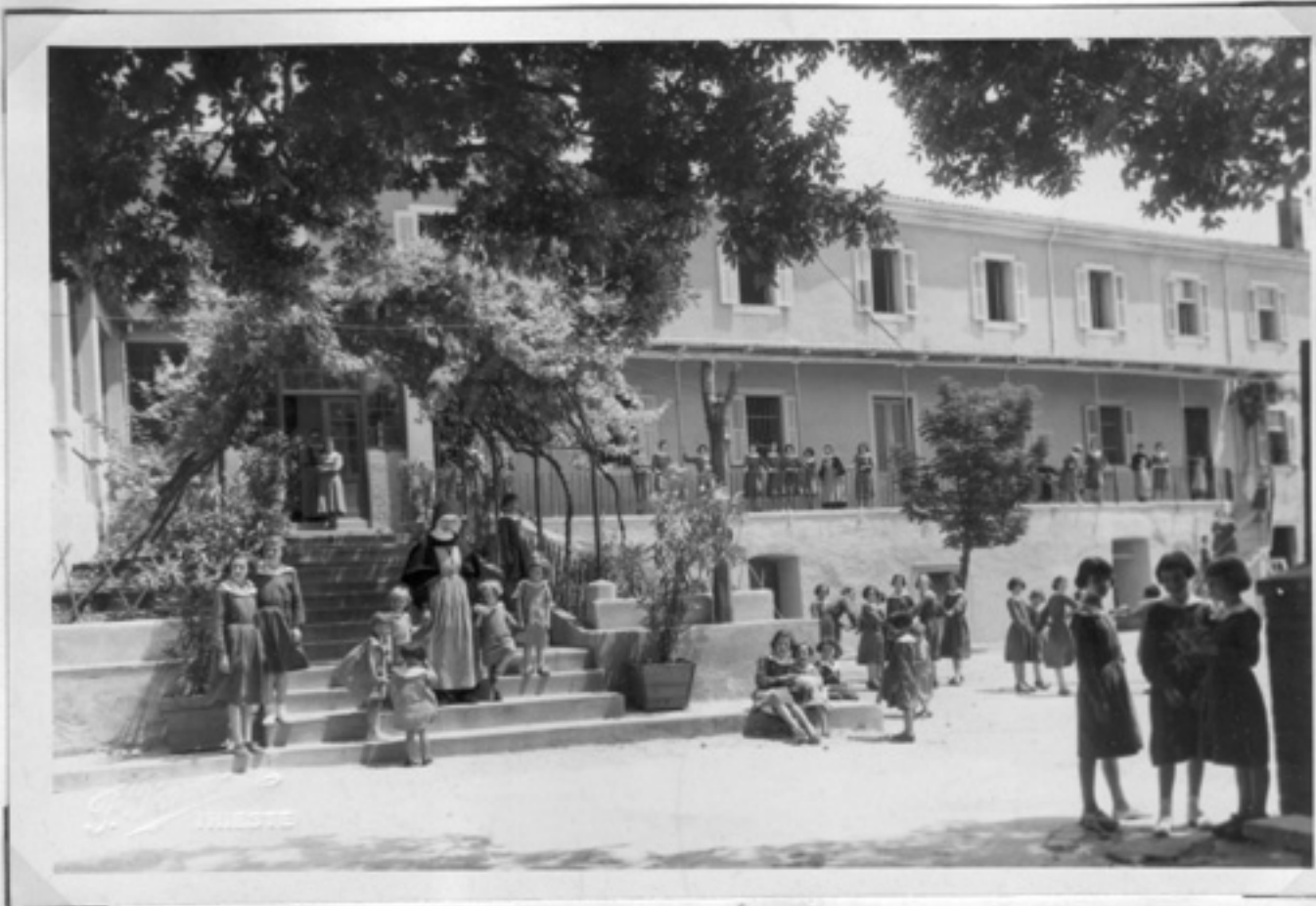
Orphanage S. Giuseppe