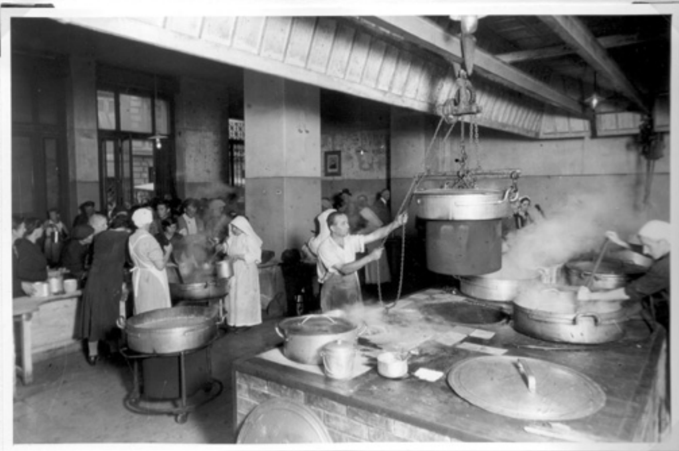
PONTIFICIA COMMISSIONE ASSISTENZA Trieste, 7 via Brunner

A memorandum describing the work done by the Pontifical Welfare Commission in Trieste has been submitted separately, and likewise a report on the use of the allocation received. Two of their kitchens for the poor are shown here.