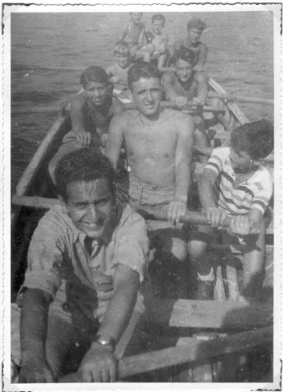
The boys of St. Rita's Oratory.