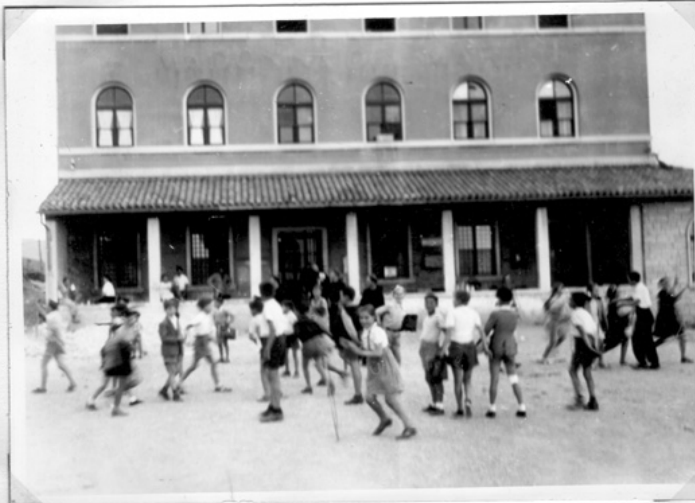
Madonna del Mare: The playground.