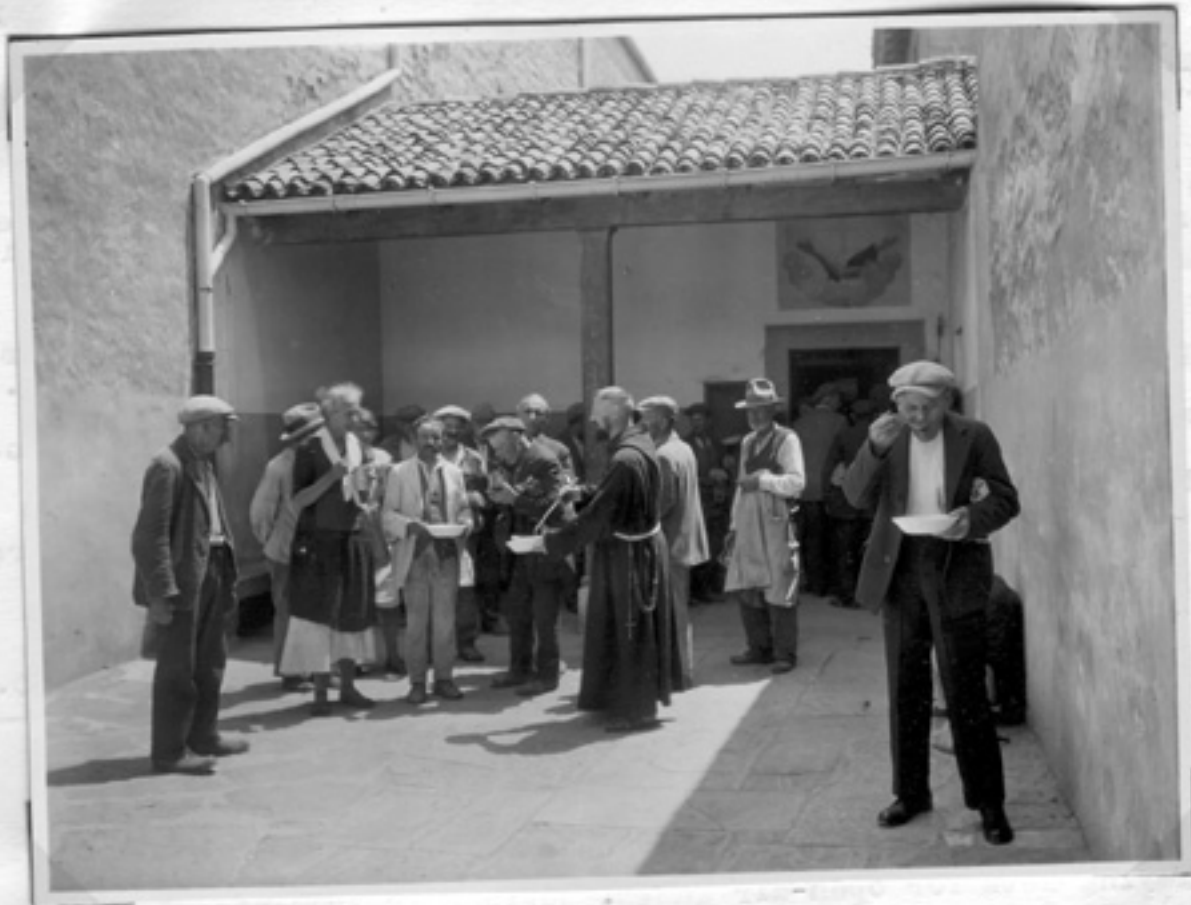
How the soup was dealt out previously.