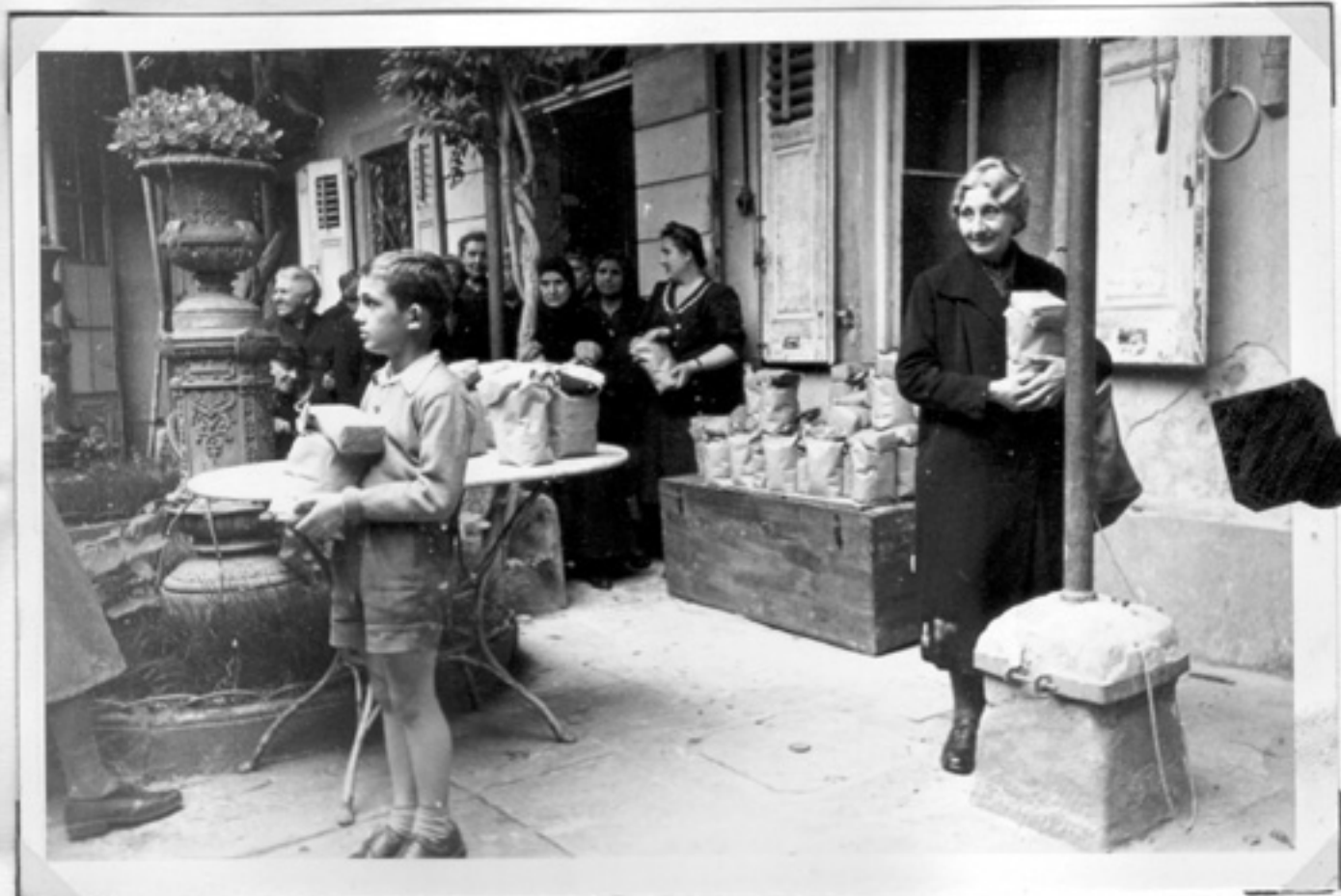
The food bought is being offered.